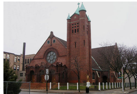
St. Gabriel Church

Transportation has been paid for by a benefactor. Lunch is not included, but participants will have the opportunity to purchase lunch at a to be determined restaurant. Please call the Ministry Center at 847-438-6622 to register!