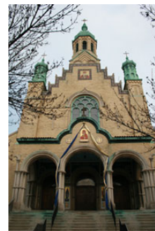
St. Nicholas Ukrainian Catholic Cathedral, www.stnicholaschicago.org

Please call the Ministry Center at 847-438-6622 to register! $30/person includes the $5 admission fee. The cost of lunch will be provided by a benefactor.