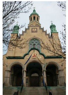
St. Nicholas Ukrainian Catholic Cathedral, www.stnicholaschicago.org

The cost of lunch will be provided by a benefactor.