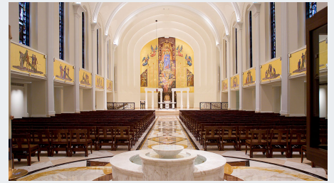
Madonna della Strada Chapel www.luc.edu

The cost is $30/person and does not include the cost of lunch. Please call the Ministry Center at (847) 438-6622 to register.