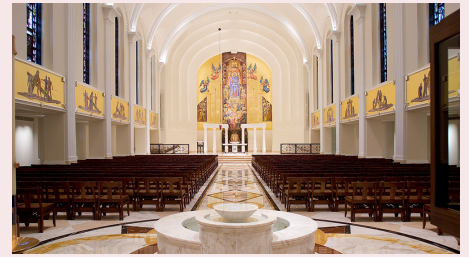
Madonna della Strata Chapel

The cost is $30/person and does not include the cost of lunch. Please call the Ministry Center at (847) 438-6622 to register.