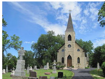
St. James Sag Bridge Catholic Church and Cemetery, Lemont, Illinois

Cost is $20/person, plus the cost of lunch. Lunch location to be determined. Please call the Ministry Center at (847) 438-6622 to register.