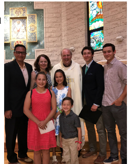
Top: Youth in attendance at the APYC Mass.