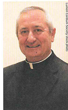
Lumen Cordium Society stock photo

These are some ways that we hold a distinctive understanding and experience of who God is for us. So, is it all the same God ? For all of us, at the end of our earthly journey we will come before the same God. On that journey, however, we have come to know and experience our God in a distinct way through the grace and gift of revelation in Jesus Christ. And we hope and pray that all people would share that knowledge and experience with us. ■