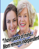
"I have peace of mind... Mom remains independent."