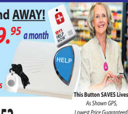
This Button SAVES Lives! As Shown GPS, Lowest Price Guaranteed!