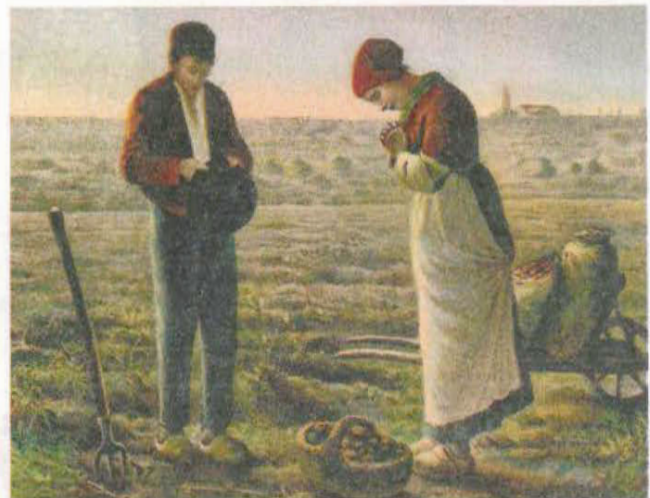
The Angelus, a painting by Jean-François Millet

So, what is the Angelus prayer and how does one pray it? The Angelus prayer is based on the biblical account of the Annunciation in the first chapter of the Gospel of St. Luke, verses