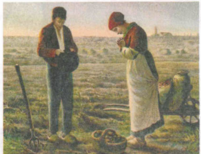
The Angelus, a painting by Jean-François Millet

So, what is the Angelus prayer and how does one pray it? The Angelus prayer is based on the biblical account of the Annunciation in the first chapter of the Gospel of St. Luke, verses