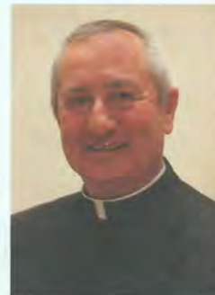
Lumen Confession Society stock photo

I remember students telling me that with the exception of Thomas Merton who was American and twentieth-century, the other writers seemed "different" and sometimes difficult to follow. Exactly so, I told them, and that was a good thing. These witnesses to faith draw us beyond ourselves and our often narrow experiences and help us to see the myriad ways that the Mystery of God draws all of us forward, each uniquely in our own circumstances, culture and historical moment. We can truly learn the ways of God from them. ■