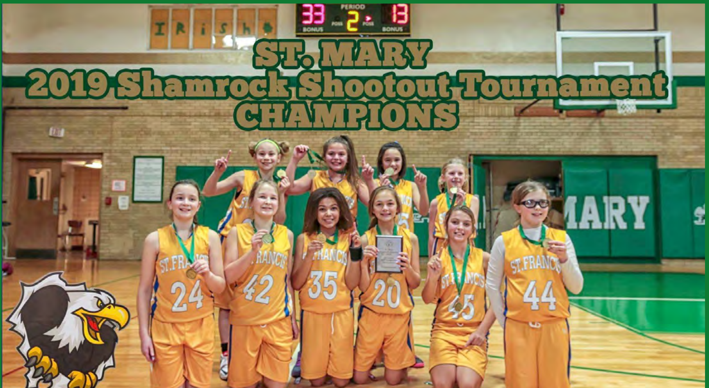
As some of you heard, the SFS 5th Grade Girls Basketball team took home the championship in last weekend's St Mary's Woodstock Shamrock Shootout. Strong team play, solid defense, and relentless high energy effort delivered a 4-0 record and the final game victory in convincing fashion over Immanuel Lutheran.