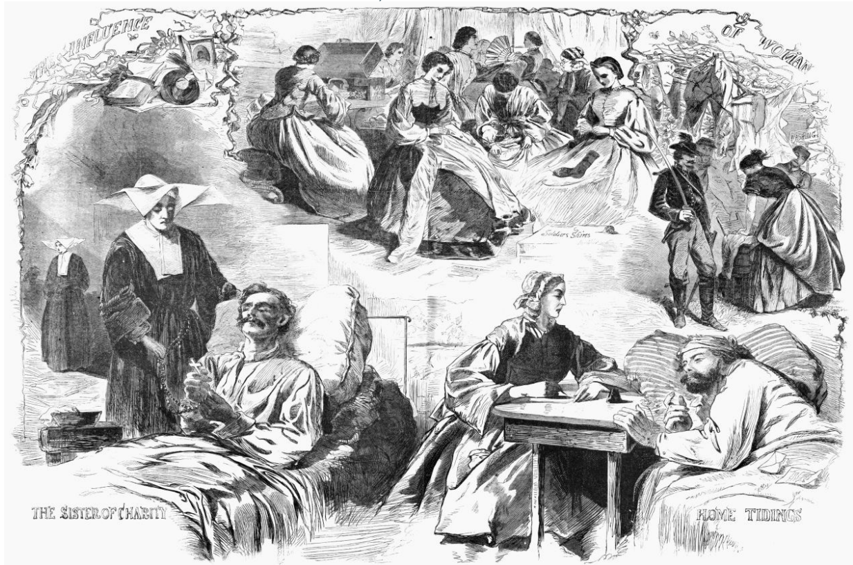
"Our Women and the War," a wood engraving of women helping the Union Army, 1862.

During the 1863 Chattanooga campaign, nuns from the Sisters of Charity tended to wounded soldiers in a Nashville, Tenn., field hospital. As they prepared to move on to another site, the men cried out in protest. Nuns on the battlefield had become a great comfort to the dying, and the soldiers passed around a petition urging them to stay.