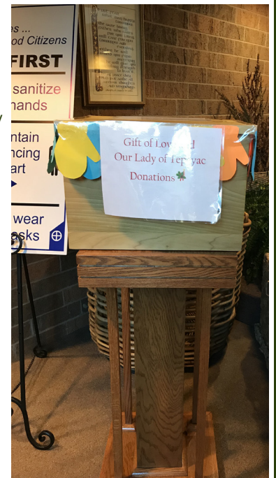
This is where you can drop the gift cards off at in the church