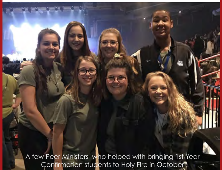
A few Peer Ministers who helped with bringing 1st Year Confirmation students to Holy Fire in October