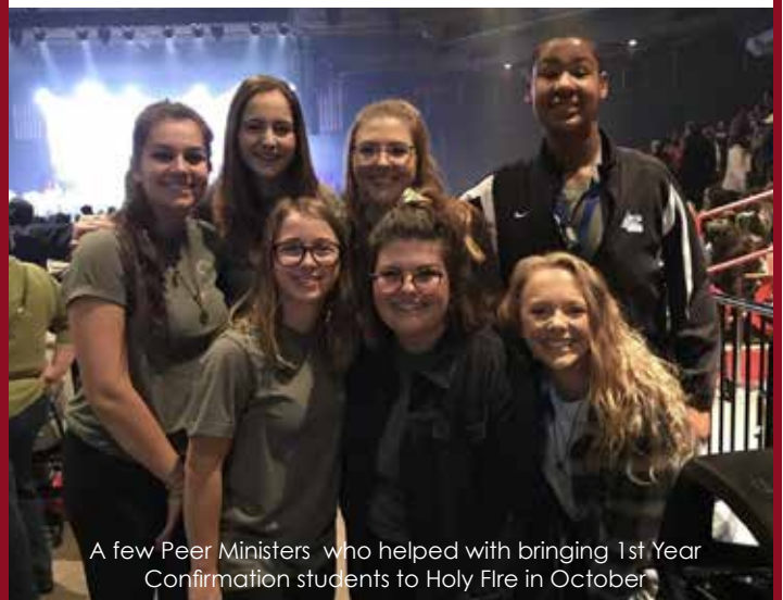
A few Peer Ministers who helped with bringing 1st Year Confirmation students to Holy Fire in October.