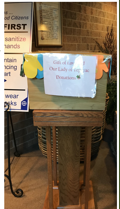
This is where you can drop the gift cards off at in the church